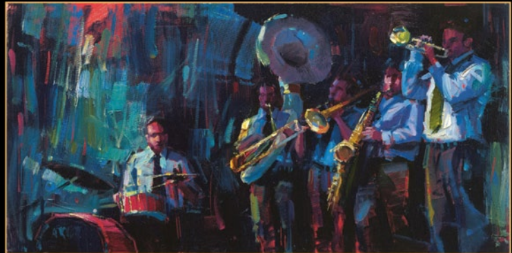
"The Blue Note", 18" x 36"

SAT., OCT. 24 - 6PM TO 9PM | SUN., OCT. 25 - 1PM TO 4PM