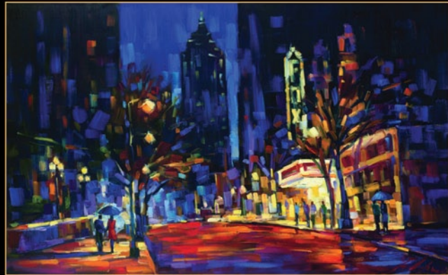
"Night At The Fox", 30" x 48"